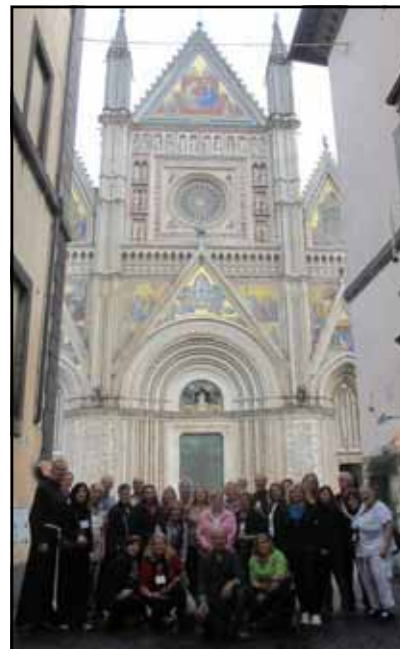
Orvieto's enormous Cathedral